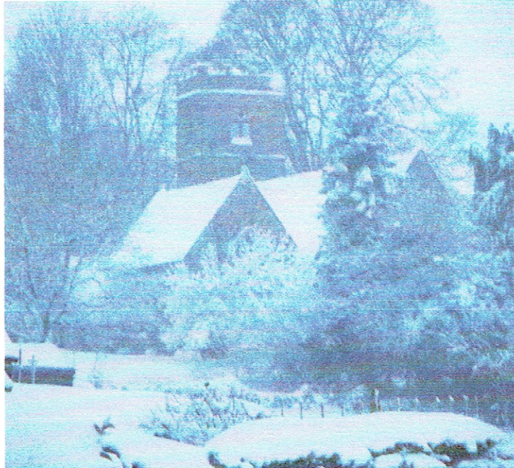
Snow covered Stottesdon Church